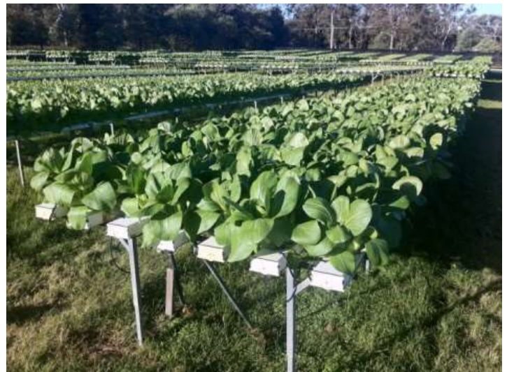
Protected and unprotected Hydroponic systems

Fertilizer is added to the irrigation water using automated dosing tanks. Electrical Conductivity (EC) is maintained at 1.1 mmhos/cm, pH is maintained at approximately 6.4, and late summer temperatures average 89°F. To evaluate the effectiveness of Pico Agriculture, Evergreen 88 tested Pico Agriculture in a single section of their farm, fed by a single 2,641 gallon tank, focusing on the production of lettuce and coriander.