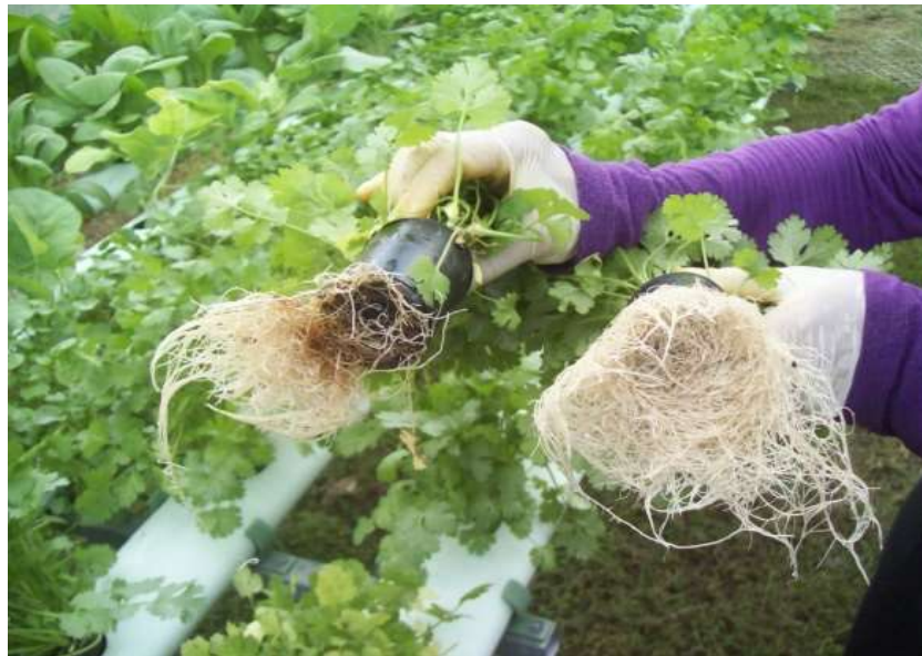
Anh Ah showing the typical difference between Untreated (Left- affected by Pythium) and Treated (Right- clean healthy roots) in Coriander.